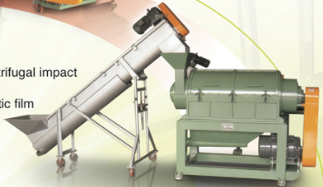
Horizontal High-efficiency Dehydrator

Dehydration rate: 99% for typical hard plastic; 90~85% for plastic film